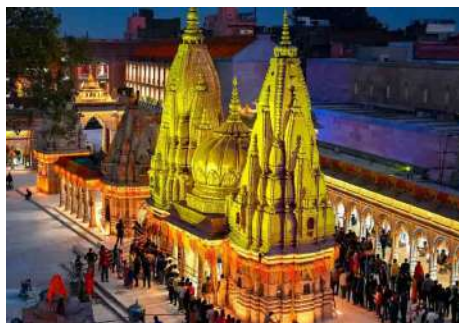
Kashi Vishwanath Temple